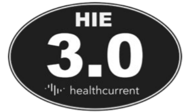
Figure 1. - HIE 3.0 Query & Retrieve